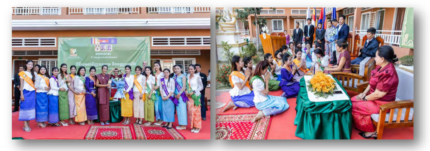
Annual fair voted to select team leader